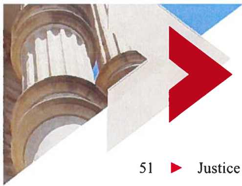
TABLE OF CONTENTS (continued)